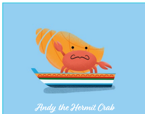
Andy the Hermit Crab